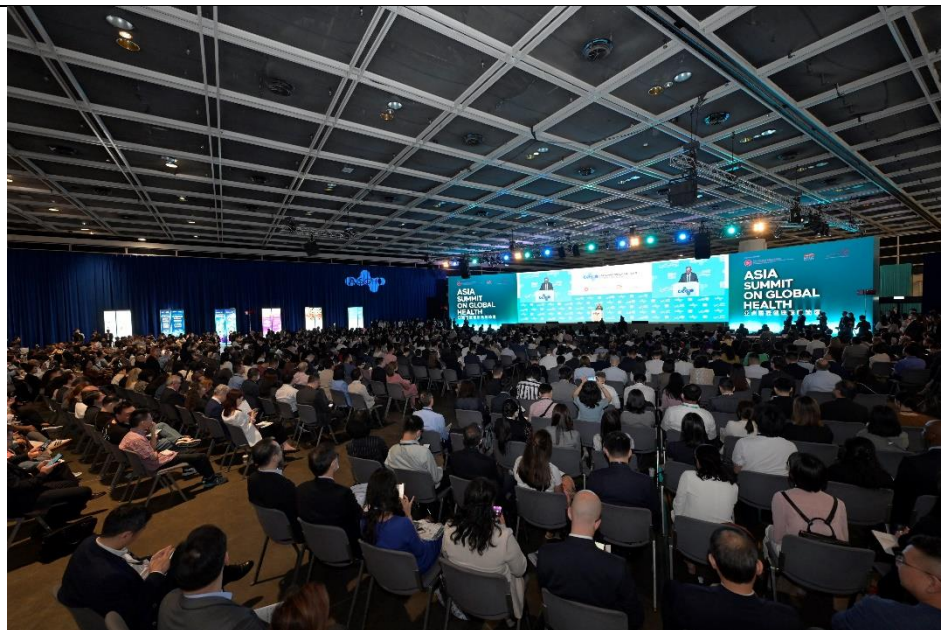
The fourth Asia Summit on Global Health , co-organised by the Hong Kong SAR Government and HKTDC, takes place today and tomorrow