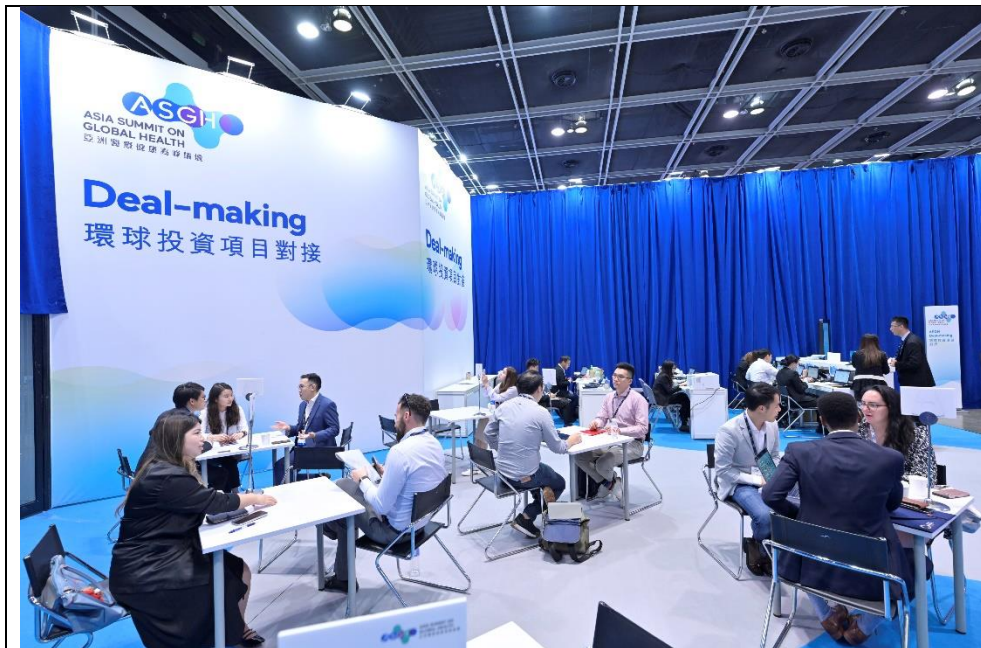
ASGH deal-making connects project owners and investors globally through in-person and online meetings