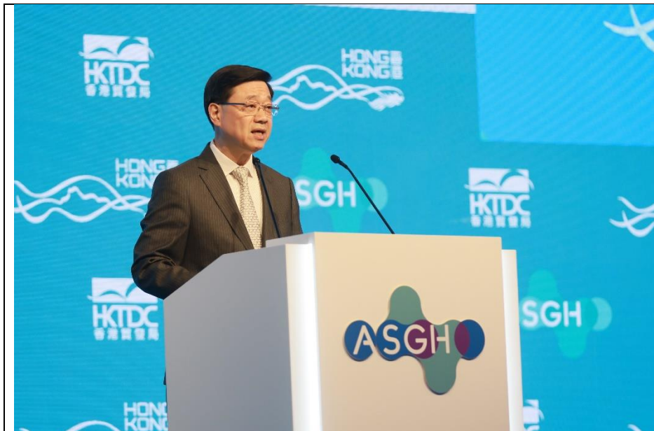
John Lee , Chief Executive of the Hong Kong SAR, delivers opening remarks