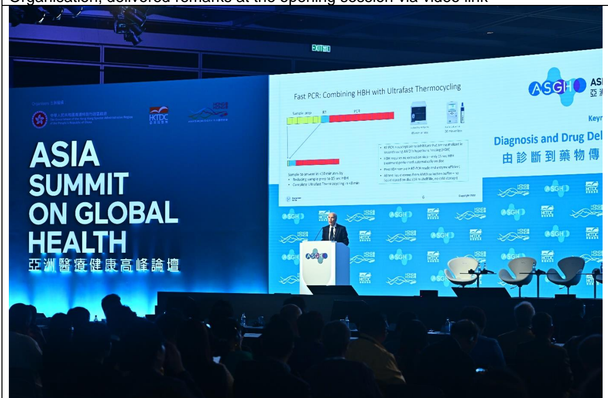
ASGH invited Prof Roger Kornberg, Nobel Laureate in Chemistry in 2006 and Professor of Structural Biology at Stanford University School of Medicine, as guest speaker