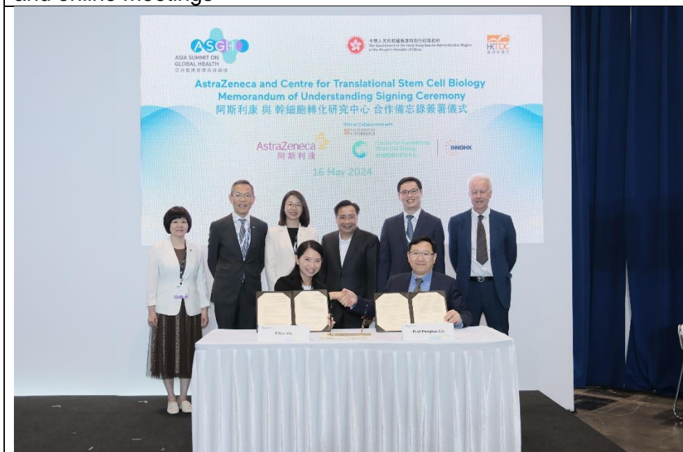
To foster collaboration across healthcare, this year's Summit also facilitated the signing of a number of cooperation agreements