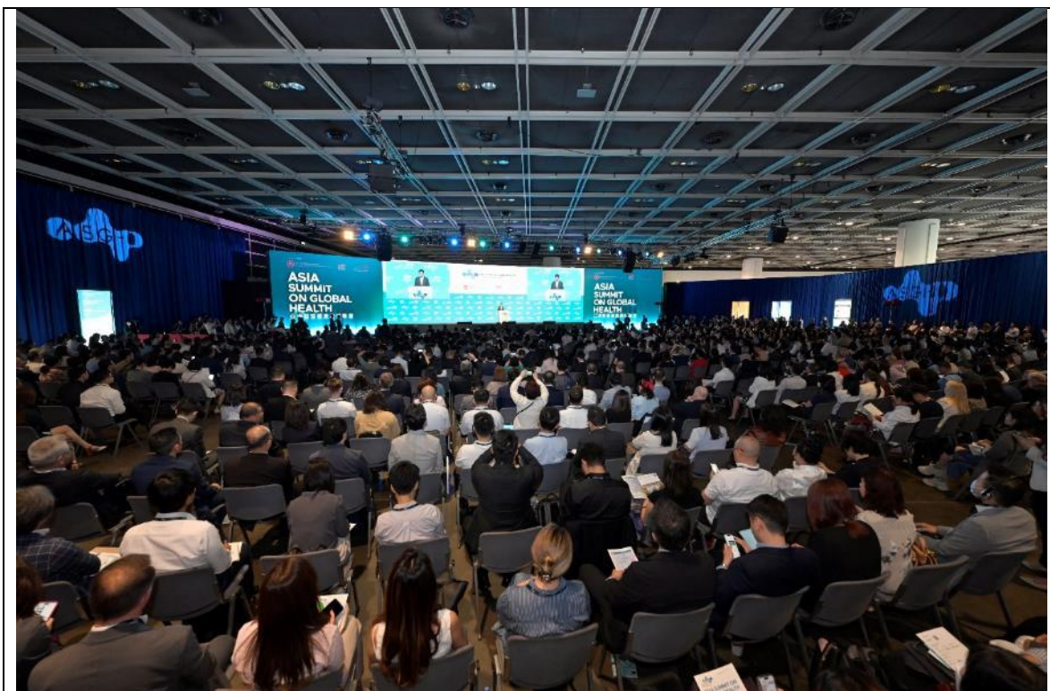
ASGH attracted over 2,800 participants from 40 countries and regions