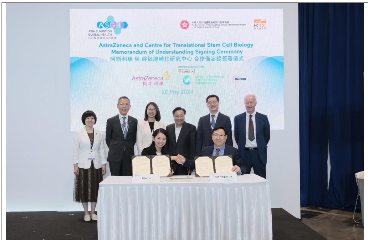
AstraZeneca and Centre for Translational Stem Cell Biology (CTSCB) formalised their cooperation at ASGH to develop life-improving healthcare solutions.