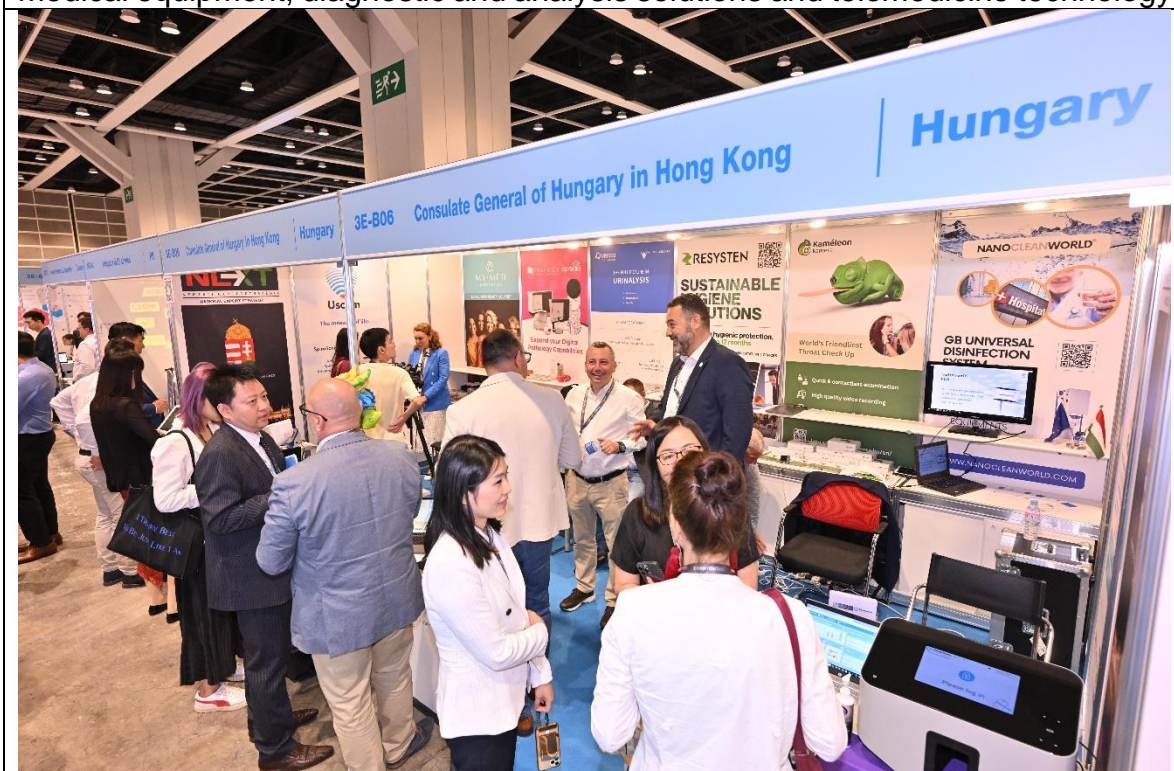
The debut Hungary pavilion showcased medical instruments applicable to fields, such as analytical testing science. Antibacterial coatings have also been featured.